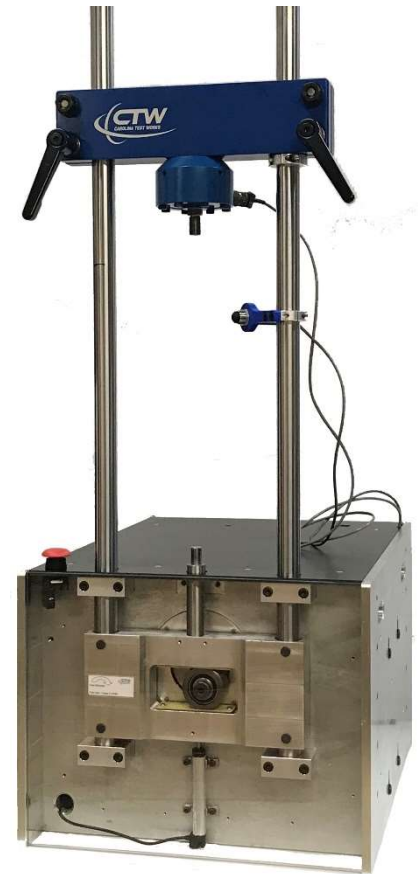
RD5 Damper Machine